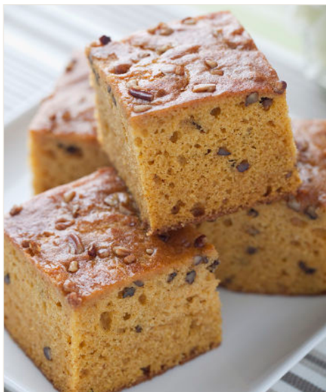
Pumpkin Bread prepared in the 2.3 Quart Casserole.