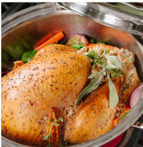
Chicken in a Pot prepared in the 4 Quart Stock Pot

Pre-heat the pan according to the instructions above. Place the chicken breast-side down in the hot, dry pot, and cook until the chicken comes away from the bottom of the pan with no resistance, and the skin is nicely browned. Turn the chicken breast-side up. Cover and cook over medium heat until steam just begins to escape from under the lid, about 5 minutes. Spin the lid to engage the Vapor Seal then immediately reduce the heat to low. Cook for 50 to 60 minutes, or until the juices run clear.